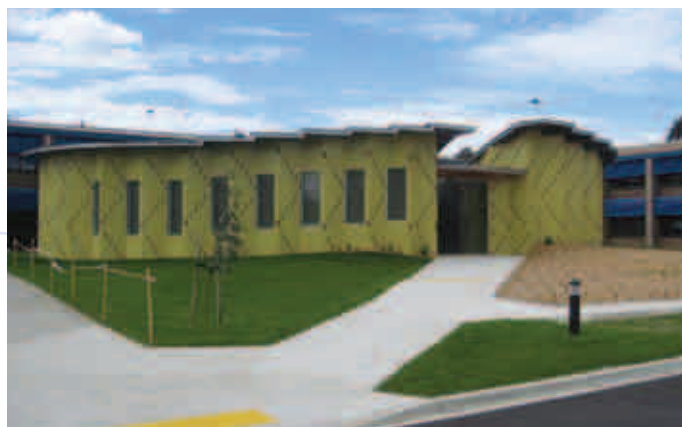
New Administration Building