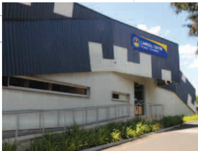
Carroll Trade Centre